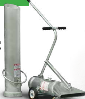
Floor Sweep Nozzle