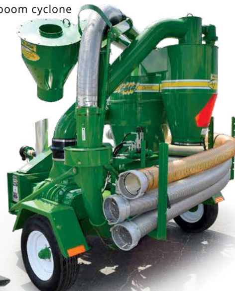
6614 REAR VIEW