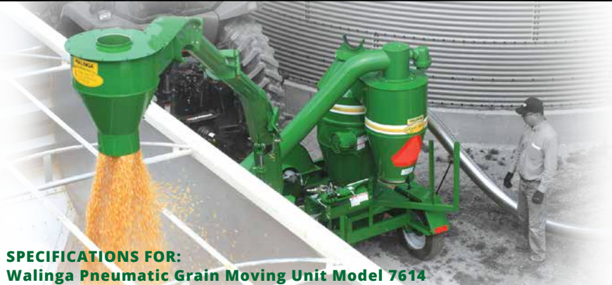
SPECIFICATIONS FOR: Walinga Pneumatic Grain Moving Unit Model 7614